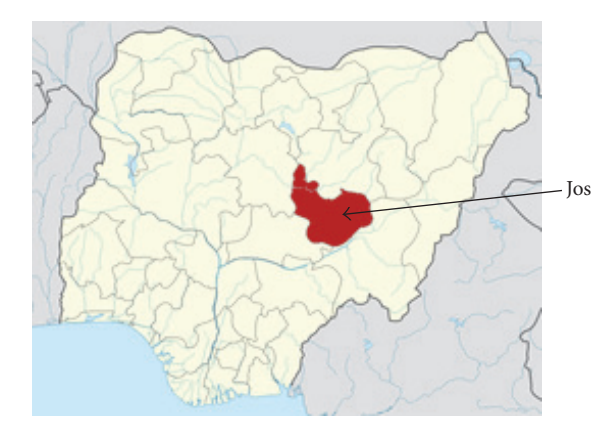
FIGURE 1: Map of Nigeria showing Plateau State (in red) and the City of Jos. https://upload.wikimedia.org/wikipedia/commons/thumb/6/66/Nigeria_Plateau_State_map.png/250px-Nigeria_Plateau_State_map.png.

The HIV treatment program at JUTH is a major public resource for HIV services in the area, providing comprehensive HIV treatment and care for the city of Jos and serving as a referral center for Plateau and neighboring states. The Decentralization Initiative's "hub-and-spoke" model of care aimed to replicate the JUTH program at smaller community hospitals in the surrounding region and to upgrade services for HIV available through the primary care facilities attached to each of these hospitals (see Figure 2). Community hospital clinics would offer clinical staging, ART initiation, and clinical follow-up, as well as HIV testing. Primary care facilities would carry out prevention education activities and HIV testing, referring individuals with positive test results to the